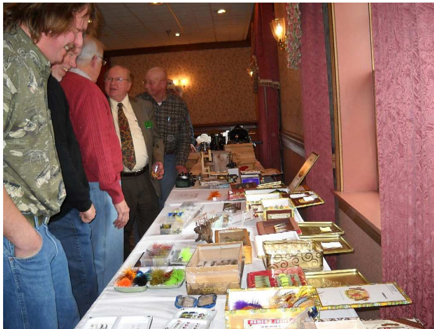
Above: Members checking out some of the items made available during the 2012 Auction. Thanks to your generosity, the 2012 auction was one of the best ever!