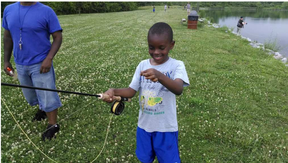
A happy young fisherman, with his first bluegill on a fly! (At the "Try Fly Fishing" event at Possum Creek on Tuesday, June 24)

For more information about the event, visit the MetroParks' website at http://www.metroparks.org .