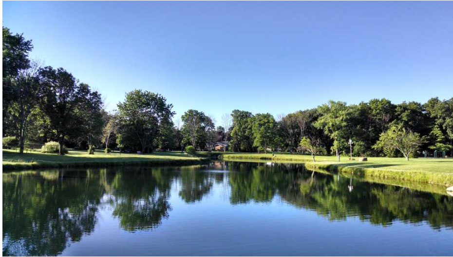
A beautiful morning at Rosewood Pond.