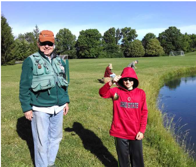
One of many bluegill caught at our first TNT event!