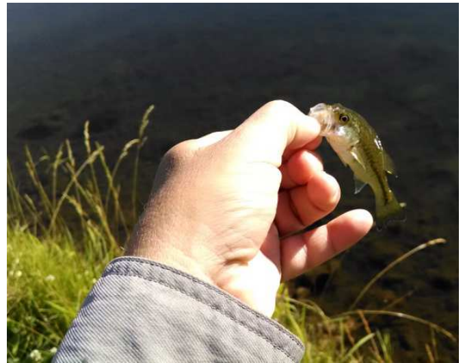
A "Monster" bass!